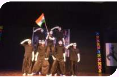
Thought Provoking Drama