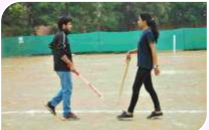
Physical Fitness & Inter College Cricket