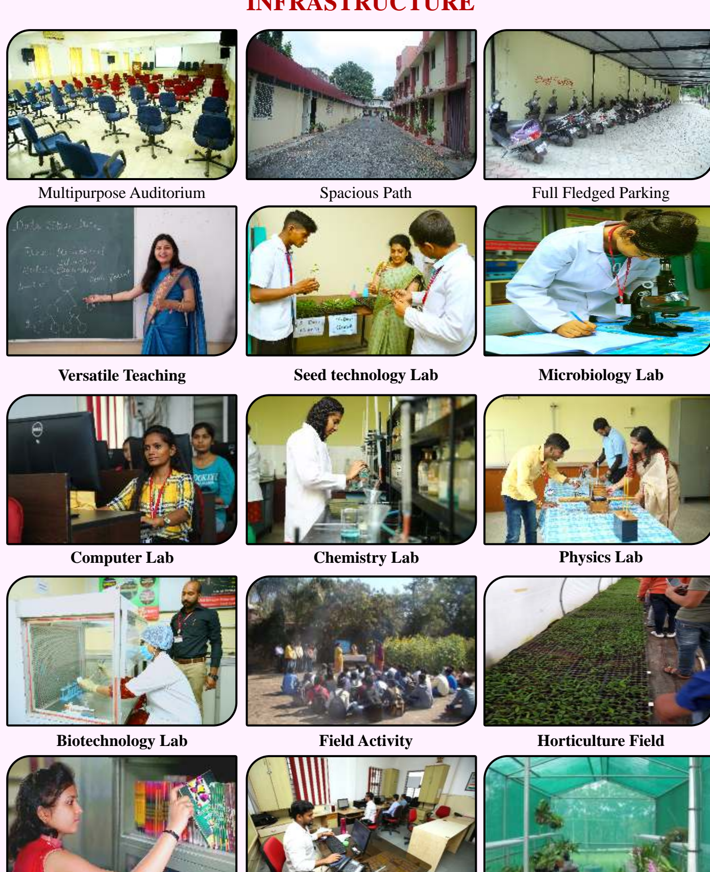
Library Office Greenhouse