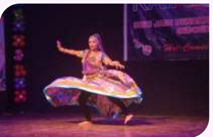
Alluring Dance Performances